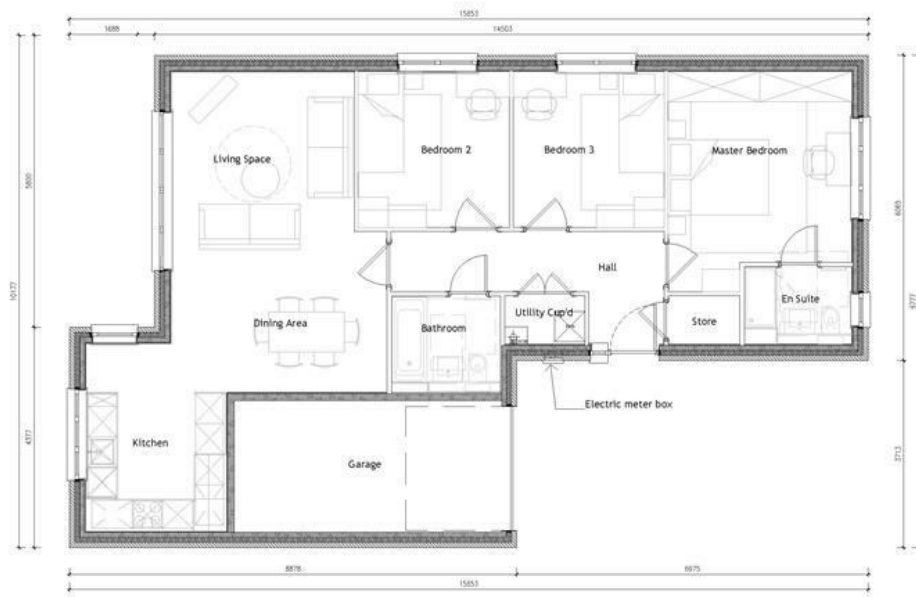
Ground Floor Plan Scale 1:50 @ A1:1:1000 @ A3